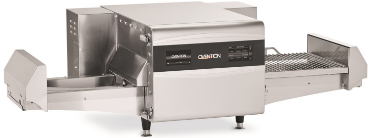
THE MATCHBOX® M1718

† Ventless certification is for all food items except for foods classified as “fatty raw proteins”. Such foods include bone-in, skin-on chicken, raw hamburger meat, raw bacon, raw sausage, steaks, etc. If cooking these types of foods, consult local HVAC codes and authorities to ensure compliance with ventilation requirements. Ultimate ventless allowance is dependent upon AHJ approval, as some jurisdictions may not recognize the UL certification or application. If you have questions regarding ventless certifications or local codes, please email