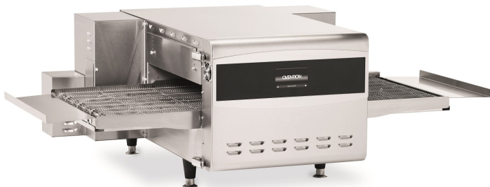
THE CONVEYOR C2000

† Ventless certification is for all food items except for foods classified as “fatty raw proteins”. Such foods include bone-in, skin-on chicken, raw hamburger meat, raw bacon, raw sausage, steaks, etc. If cooking these types of foods, consult local HVAC codes and authorities to ensure compliance with ventilation requirements. Ultimate ventless allowance is dependent upon AHJ approval, as some jurisdictions may not recognize the UL certification or application. If you have questions regarding ventless certifications or local codes, please email connect@ventionovens.com .